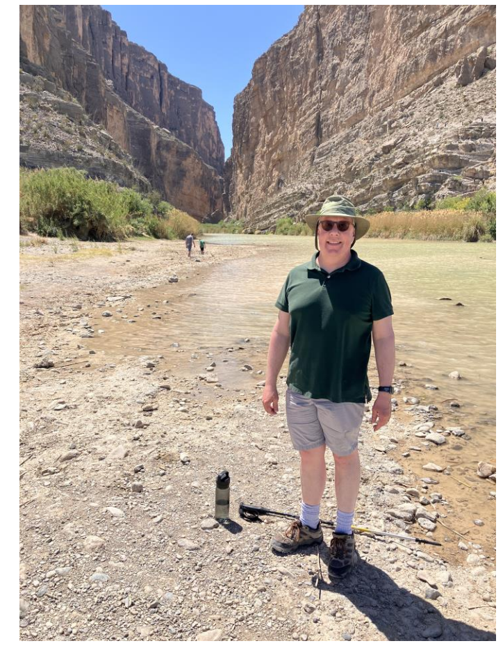
Rio Grande River, mouth of Santa Elena Canyon Big Bend National Park, Texas, 10 April 2024

About me: Enjoy biking, hiking, and doing crossword puzzles. Just had solar panels installed at our home.