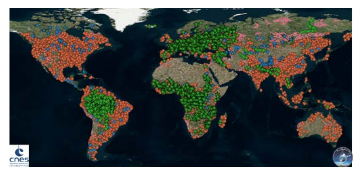
Figure 11. Virtual station network on HYDROWEB database http://hydroweb.theia-land.fr/

The future SWOT mission to be launched in 2022 is considered as a breakthrough, as it will provide images (and not just a sampling along the satellite orbit) of water elevation (with 10cm accuracy) and extent. It will therefore provide the very first comprehensive and quasi-global view of Earth's freshwater bodies from space and will characterize changing volumes of fresh water across the globe at an unprecedented resolution. Discharge variations in rivers will also be inferred from SWOT, globally. These measurements are key to understanding surface water availability and in preparing for important water-related hazards such as floods and droughts.